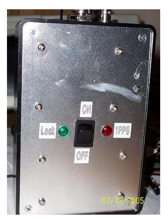
Figure 3 Front View