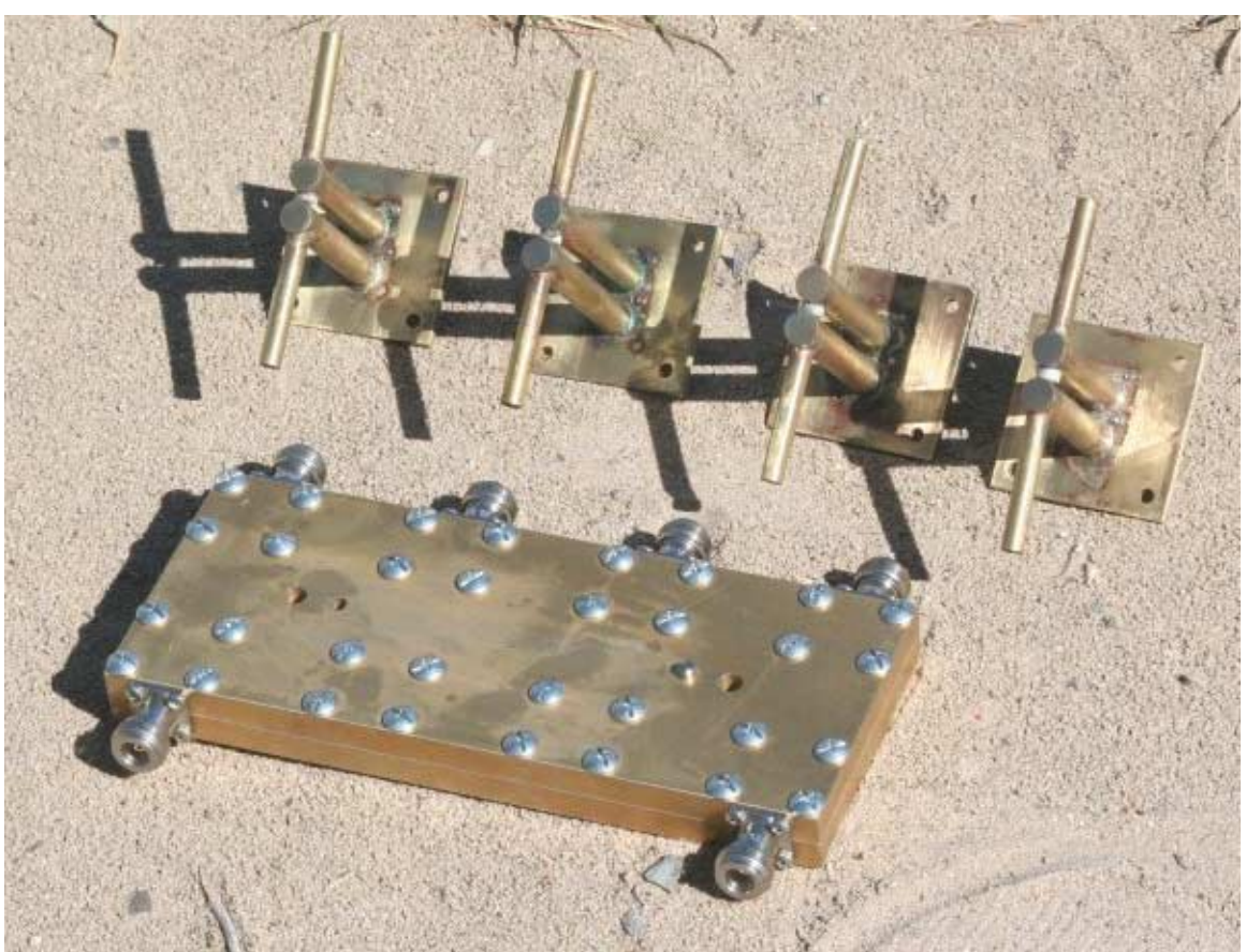
The 4 dipoles and hybrid built by Dick, K6HIJ to install at OVRO feed area so we can work 1296 MHz EME with right and left circular polarizations.

A picture from the February Japan CQ magazine that had photographs and story about the OVRO operations by SBMS.