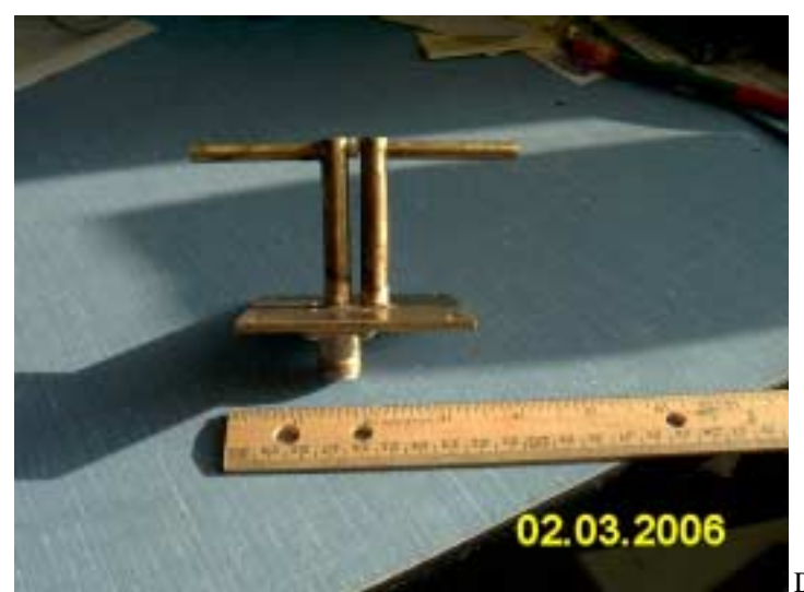
Dick, K6HIJ built this feed for OVRO based